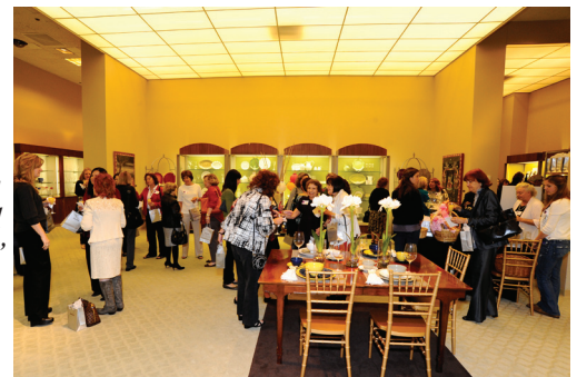
Guests enjoying brunch bites and mimosas prepared and served by Neiman Marcus’ Zodiac restaurant.