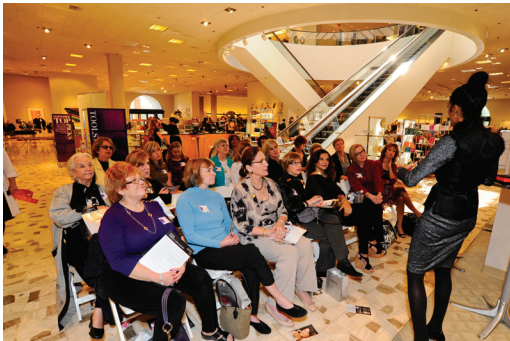
Participants at one of the morning’s four informative stations led by national beauty experts.